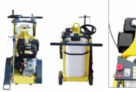
Water tank 25 L