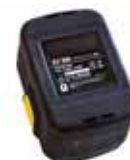
x 2 batteries B1840

Transport case + 2 batteries + 1 battery charger