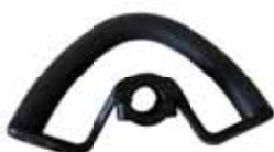
Low hand-arm vibration handle