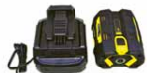
Battery 5 (A) 70 min