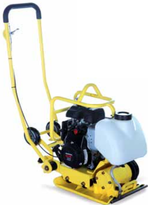
Ultra compact design