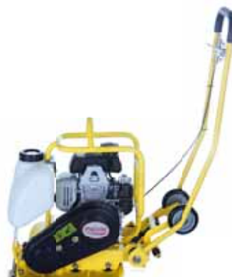
Transport wheels included