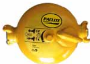
External oil lubricator Code : PAC-LUB