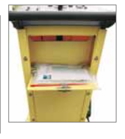
Document and tool box