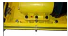
Option: Accessory - stone paving pad